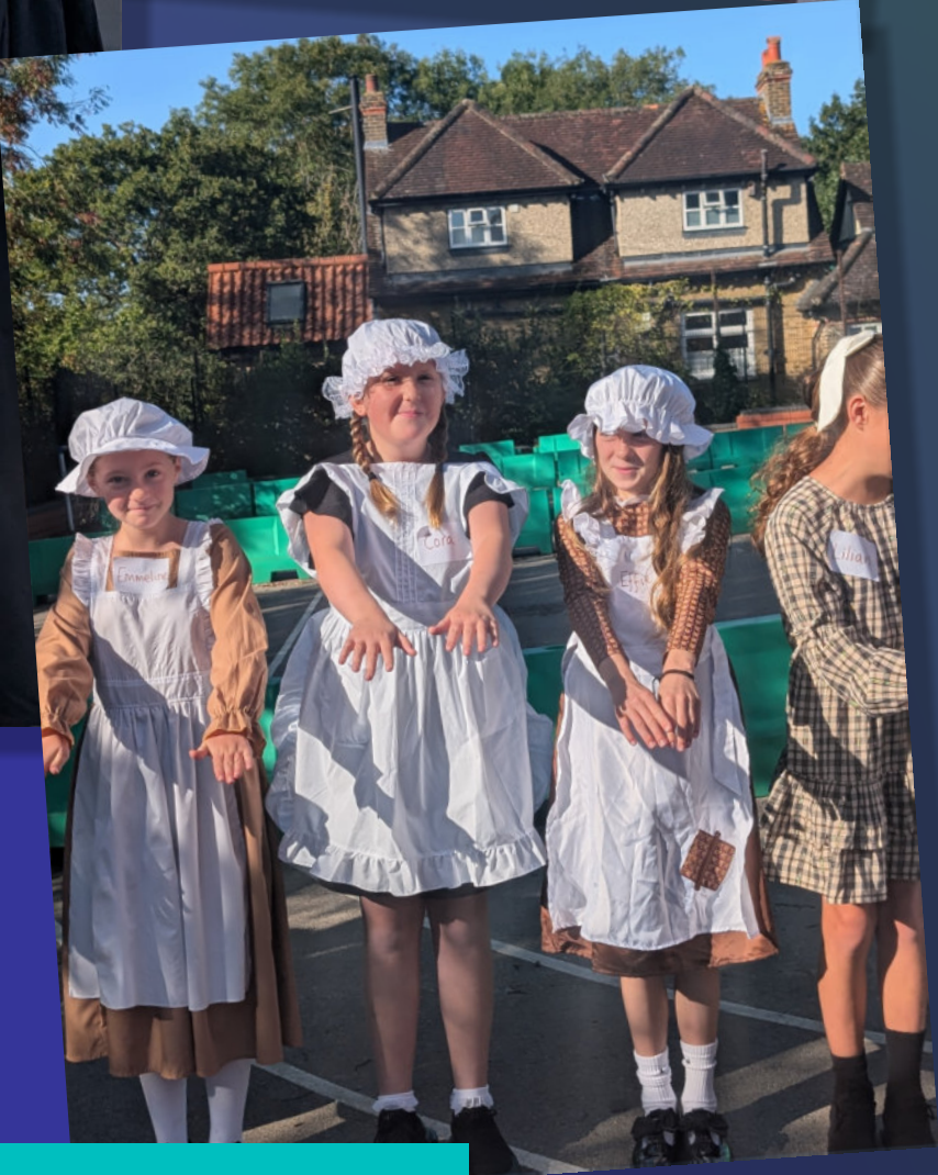
Year 6 started their history topic with an immersive Victorian Day - this was the finger nail inspection.