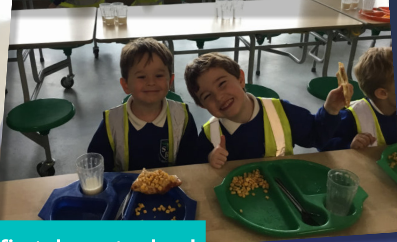
Reception children enjoying their first days at school, including having school lunch for the first time and reading with older children in the library